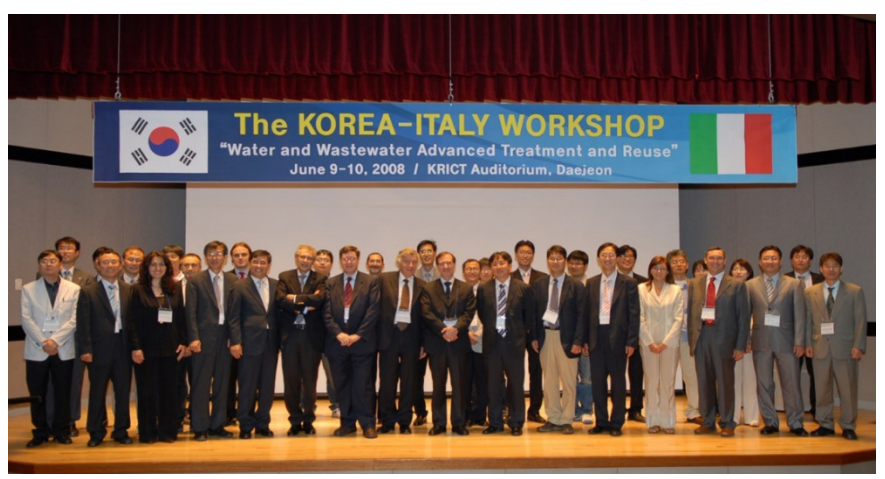
The 6th workshop in KRICT, Dajeon 2008

I wish him continue his activities and always be healthy and happy.