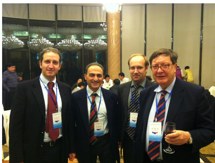
Fig. 2. China-EU Workshop 2012 in Weihai, China, 2012.